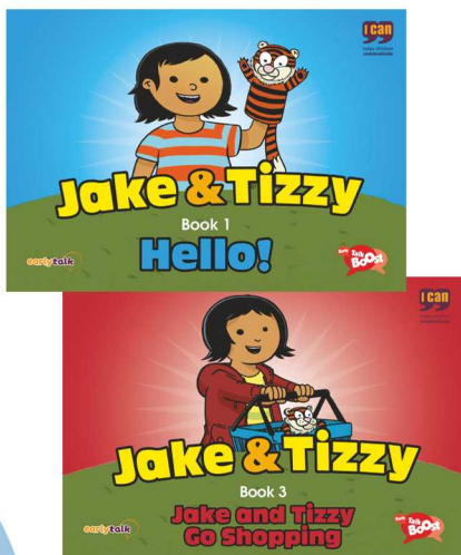
Early Talk Boost (3-4 years) Results: ISO7022013

Each Early Talk Boost intervention pack includes; Participant Book, Intervention Manual, Parent Workshop materials, Tracker Tool, Toolkit of toys, puppets and musical instruments and 10 x 8 Jake and Tizzy story books.